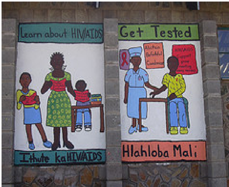
Portions of an HIV/AIDS Awareness mural