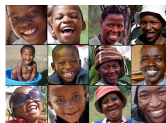
2010 Friends of Lesotho Calendar Let Lesotho Smile on You Available in September at www.cafepress.com/lesotho

start at FOL first. Friends of Lesotho is an Amazon.com affiliate. Access Amazon.com from the FOL website and a portion of the price of your purchase will be donated to FOL by Amazon.com. Go the FOL Donations Page on our website and use the link there to Amazon.com. www.friendsoflesotho.org/fundraising/stuff.html