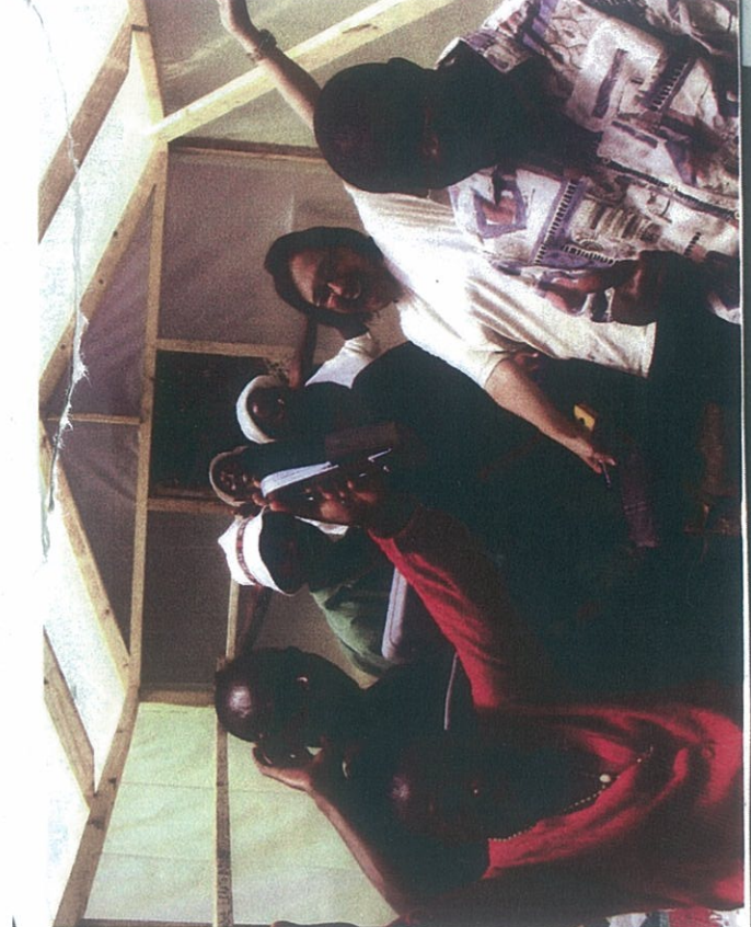
Donations helped to purchase materials to build a greenhouse at St. Joseph's Hospital in Roma, enabling those living with HIV/AIDS to grow seedlings for income generation.