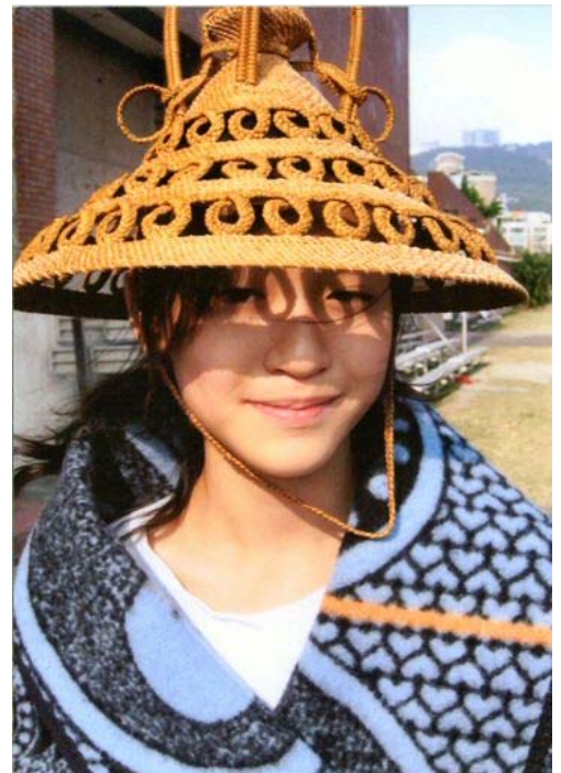
From Taipei American School

Would you like this newsletter delivered to your Inbox? Sign up for email delivery today via the FOL website under membership update information.