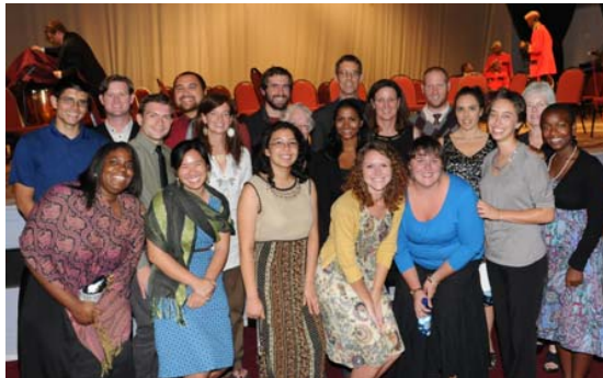
Volunteers, staff and friends at a Classical Music Concert at the Convention Center on Feb 5th