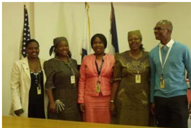
Peace Corps Lesotho staff.