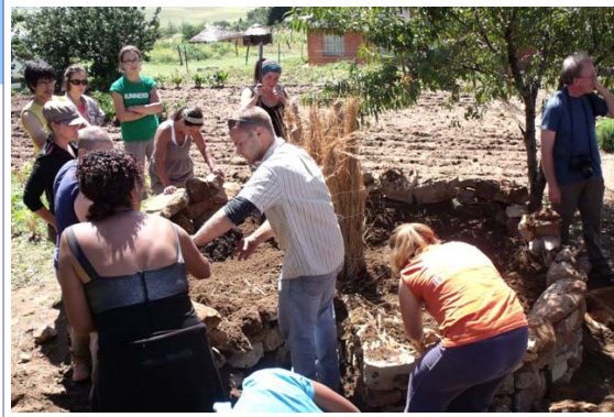
ED10 Phase III