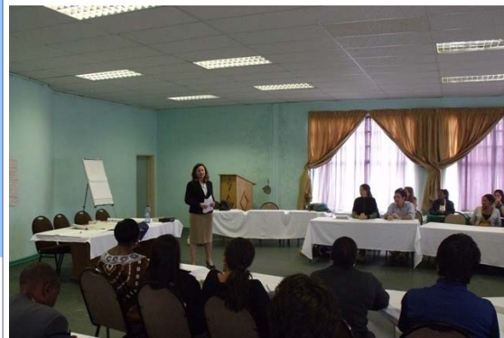
PDM Workshop with supervisors