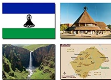
Set of 4 Magnets