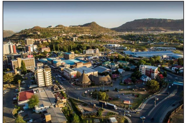
Do you recognize Maseru? (Basotho Hat in center of photo). https://www.pinterest.com/pin/best-cities-to-visit-in-lesotho-856317316633789627/