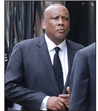
King Letsie III in London

While many of the world's politicians made the trip to England to honor Queen Elizabeth, royalty from nearly every continent also arrived in a show of reverence for all the Queen accomplished during her 70-year servitude to the crown, including King Letsie III of Lesotho.