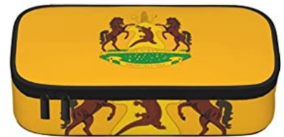
Pen Pencil Stationary Case