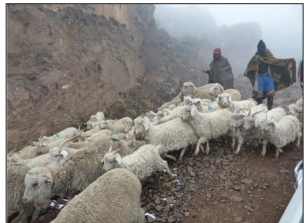
Traffic jam Sani Pass

https://chemadventures.wordpress.com/2013/11/08/journey-into-the-mountain-kingdom-of-lesotho-sani-pass-to-thaba-tseka/