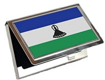
Business Card Holder