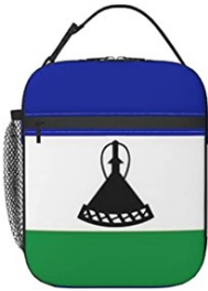
Insulated Lunch Bag

https://smile.amazon.com/gp/chpf/homepage?orig=%2F