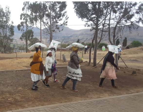
Walking home knowing that hunger has been vanquished for a few days