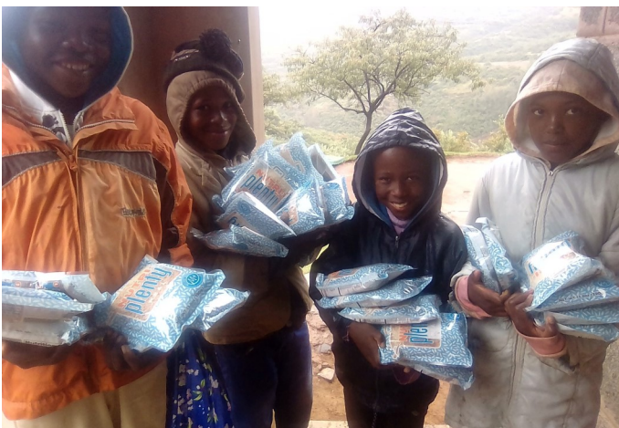
Like the world over, these children are eager to help when given the opportunity