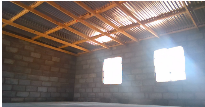
The new classroom is nearing completion

Prior to the construction of this classroom, several classes were crowded into one room that provided little protection from the elements. The entire school had only 3 classrooms for 250 students, which led to severe overcrowding. This new classroom adds much needed space for a more conducive learning atmosphere.