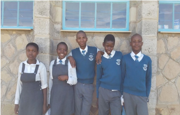
TAP recipients are chosen based on merit and recommendation