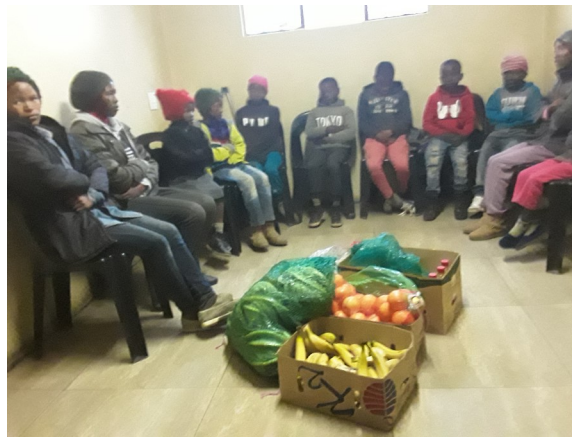
People waiting patiently to get their allotment