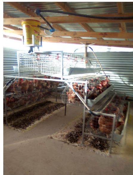
FOL funds made building and equipping this chicken coop possible in 2019

FOL supplied funds to help the organization drill a bore hole to help supply water for a chicken project. This project is designed to enhance capacity building to the community through training on chicken raising and market research. Another stated goal of this project was the empowerment of women in the community. Lastly, the project hopes to serve two hundred and sixty-five (265) beneficiaries from the families of HIV/AIDS and TB patients.