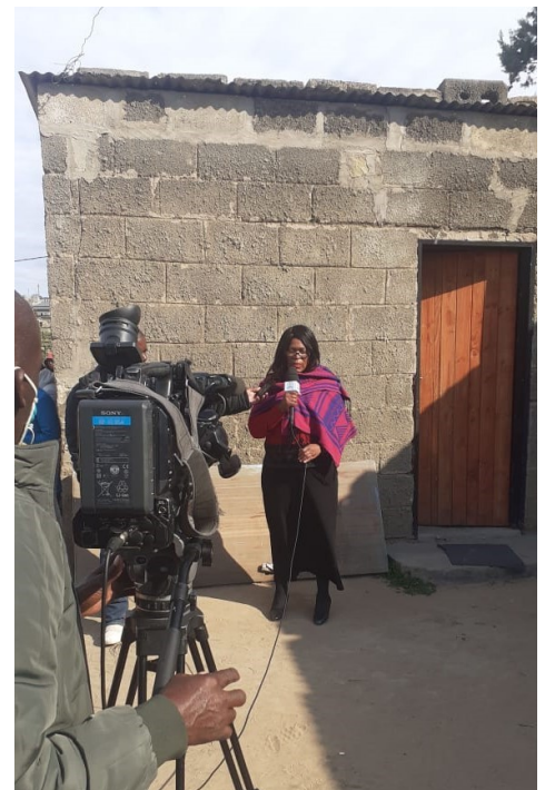
Lesotho TV documents distribution of food parcels at Khubetsona Ha Rankhala