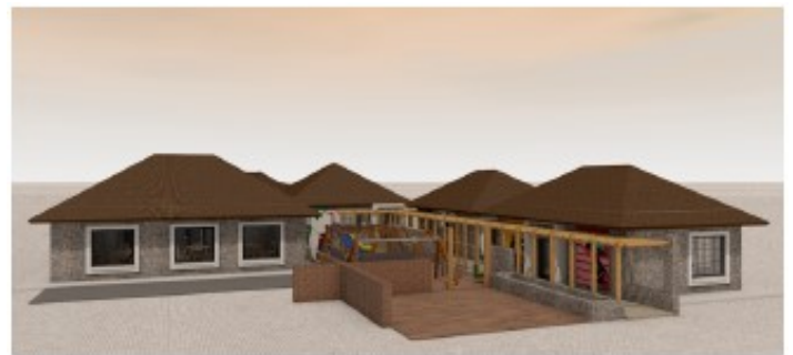
Architect's rendering of Ha Sekantsi Learning Center

FOL contributed towards the construction of the Ha Senkantsi Learning Center. The center will provide opportunities and spaces for young girls and women especially those categorized as under privileged to come together and engage in meaningful exchanges that spark collaborative action including creating self-employability projects that will generate consistent income for their families and community. Through this project, reading and homework clubs have been established in order to create a reading culture and improve literacy and numeracy skills in the community.