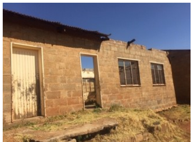
Piting Primary School buildings prior to renovation

FOL was able to provide funds to repair one block of classrooms. These repairs included doors, windows, and new rooves.