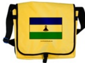
Totes and bags

Also download free note cards for Alternative Gift-Giving or Memorial Gifts at this site.