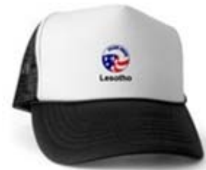
Hats and caps

Purchase T-shirts and Basotho CDs at FOL's website!