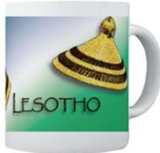
Cups and mugs